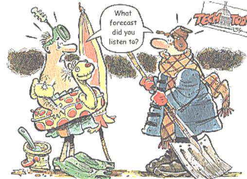
What forecast did you listen to?

Modified (slow) release Baclofen to increase compliance and minimize side effects. New Baclofen indication: To reduce BINGE EATING.